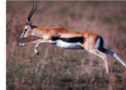
Thomson's gazelle in Tanzania.

Gazelles are herbivores. That means they eat mainly herbs, bushes, and rough desert grasses. Some gazelles need more water than many plains animals. These gazelles often eat early in the morning or at night, when leaves contain more water than they do in the heat of the day.